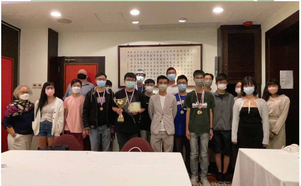
Group photo of the Championship